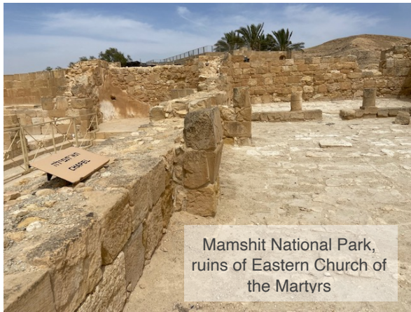
Mamshit National Park, ruins of Eastern Church of the Martyrs

Was it a coincidence that the origins of where incense like frankincense and myrrh were once traded in this region connecting strategic points through Yemen and Oman, passing through Saudi Arabia, Jordan, and ending at the ancient port of Gaza, are being targeted by Israel's enemies? Our anchor scripture found in Revelation is one of several passages that tie the "prayers of the saints" to incense that rises up before God's throne. Another passage in Revelation paints a beautiful eschatological reference to our intercessory prayers, "And when he had taken the scroll, the four living creatures and the twenty-four elders fell down before the Lamb, each holding a harp, and golden bowls full of incense, which are the prayers of the saints" ( Revelation 5:8, ESV ).